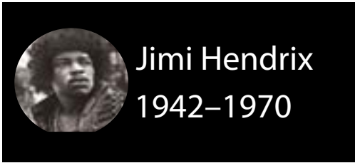
Jimi Hendrix 1942–1970

27-year-old rock star, Jimi Hendrix, died in London. Hendrix was a as an american musician, singer and songwriter. He is widely considered one of the most influential electric guitarists in the history of popular music and one of the most celebrated musicians of the 20th century.