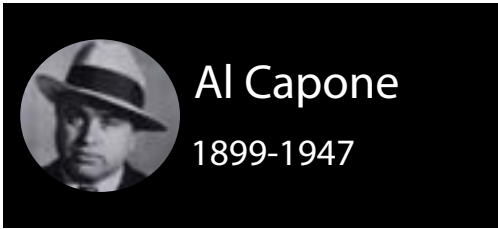
Al Capone 1899-1947

Mobster Al Capone was convicted of income tax evasion for which he was sentenced to 11 years in prison in 1931. Capone was an American gangster who led a Prohibition-era crime syndicate. The Chicago Outfit, which subsequently also became known as the "Caponese", was dedicated to smuggling and bootlegging liquor, and other illegal activities in Chicago from the early 1920s to 1931. Born in the borough of Brooklyn in New York City to Italian immigrants, Capone became involved with gang activity at a young age after being expelled from school at age 14. One of the most notorious American gangsters of the 20th century, Capone has been the subject of numerous articles, books, and films. Capone's personality and character have been used in fiction as a model for crime lords and criminal masterminds ever since his death. The stereotypical image of a mobster wearing a blue pinstriped suit and tilted fedora is based on photos of Capone. His accent, mannerisms, facial construction, physical stature, and parodies of his name have been used for numerous gangsters in comics, movies, music, and literature.